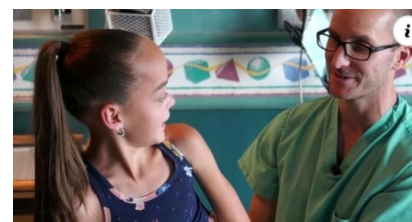
YOUTUBE.COM SpineScreen App tutorial