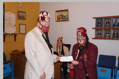
Cheque presentation to the Potentate