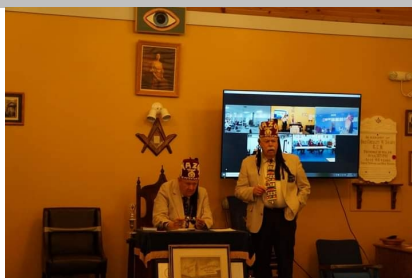
Stated Meeting in Burin