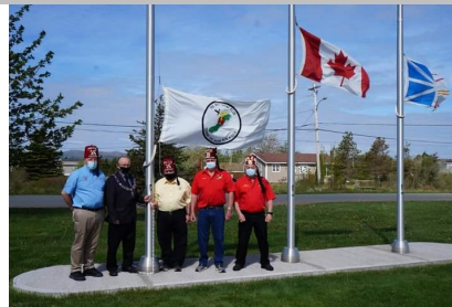
The Boot Shrine Celebrating In Burin

June 6 was a special day for Shriners everywhere. International Awareness Day celebrates the founding of the original governing body of the Shriner's fraternity in 1876 in New York City; as well as the many good things Shriners do in support of our young patients globally.