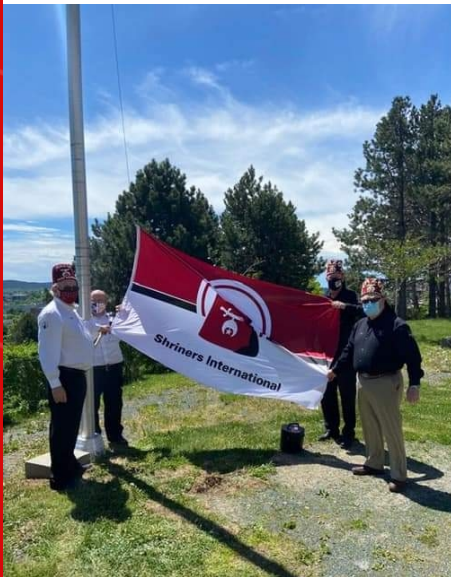
Mazol Shriners Celebrating at Confederation Building St John's