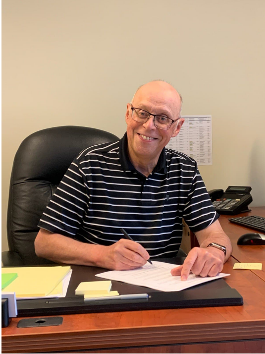
The Honourable John Haggie Minister of Health and Community Services