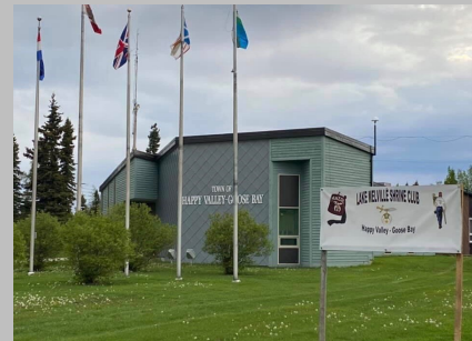
Lake Melville Shrine Club Happy Valley Goose Bay Celebrates Shrine Awareness Day !

Mazol has been active in Newfoundland and Labrador since -----, and continues to stand out across Canada in its support of Shriners Hospitals for Children. During the week of June 6 th ., the Shrine Flag was flown in St. John's at the Confederation Building, as well as in Burin and Happy Valley Goose Bay. Here are a few pictures from these locations: