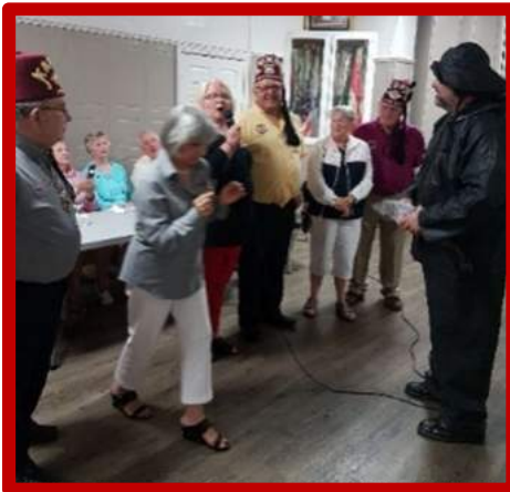
A "Screech In" for our guests.